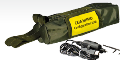
HHMD Configuration tool