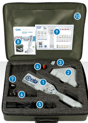
PD140N Set inside the Carry Bag