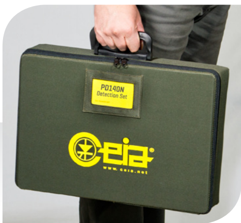
☑ PD140N Hand Held Detection Set with carry bag